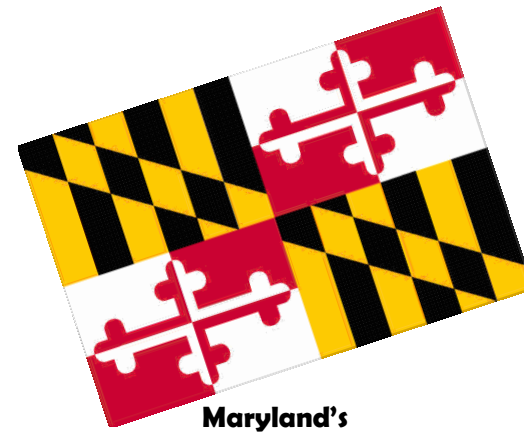
Maryland's Cigarette Restitution Fund Program (CRFP)

Get involved! Join our local cancer/tobacco community health coalition to have a voice, and to learn how to win the fight for the health of everyone.