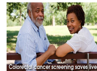
Colorectal cancer screening saves lives

After lung cancer, colorectal cancer is the 2nd most common cause of cancer death for men and women in the U.S. To meet this challenge, the Health Dept. started the Colorectal Cancer Screening Program in 2001, funded by the Cigarette Restitution Fund. This program provides free colonoscopies to eligible Somerset County residents age 50-64, and to younger clients with a family history of colorectal cancer.